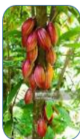
Planted area not regulated as part of value chain

Image from presentation slide—key points in the cocoa supply chain where actors could be made legally responsible for buying cocoa from illegal areas: